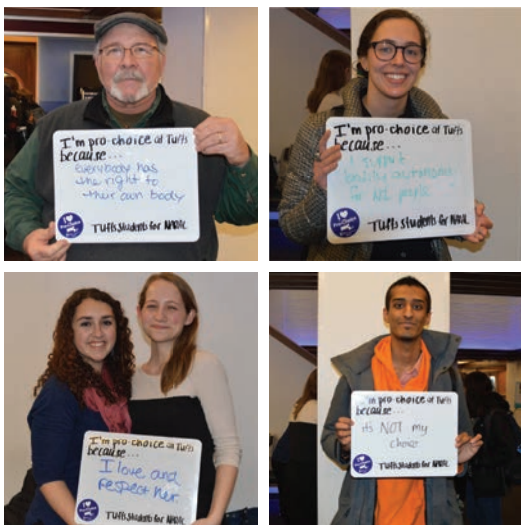
I'm Pro-Choice Because... Photo Campaign