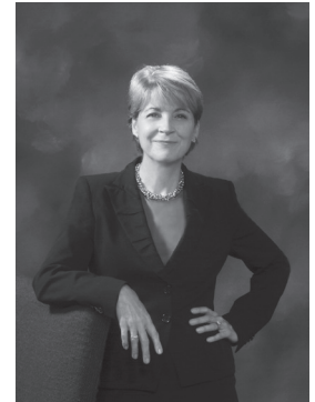
Attorney General Martha Coakley

Laws protecting reproductive freedom are always under attack. It is essential that the Attorney General vigorously defend legal protections for a woman's right to choose in the courts. For example, when the Buffer Zone Law faced a legal challenge from anti-choice activists, Attorney General Coakley defended the need for this public safety law.