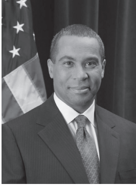
Governor Deval Patrick

NARAL Pro-Choice Massachusetts endorses Deval Patrick and Tim Murray for re-election.