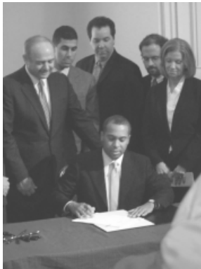
Governor Deval Patrick signs the Buffer Zone Bill into law.

"bubble" within an 18-foot zone of regulated conduct outside of reproductive health care facilities. A person could not knowingly approach another person within the six-foot "bubble" unless they obtained that person's consent.