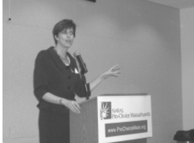
Rep. Katherine Clark speaks about the importance of elections.

The recently elected state representative from Melrose and Wakefield, Katherine Clark, spoke last month at the NARAL Pro-Choice Massachusetts Annual Meeting, held at the Law Offices of Holland + Knight in Boston. She addressed a packed room of supporters and activists who were eager to hear about the importance of elections.